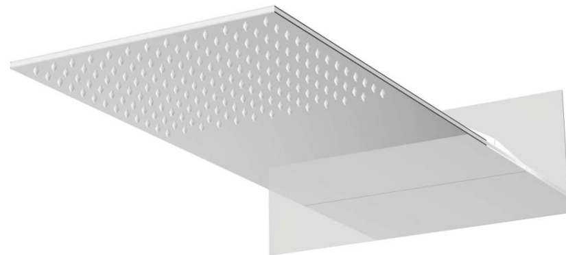
Rain shower AWMS-300